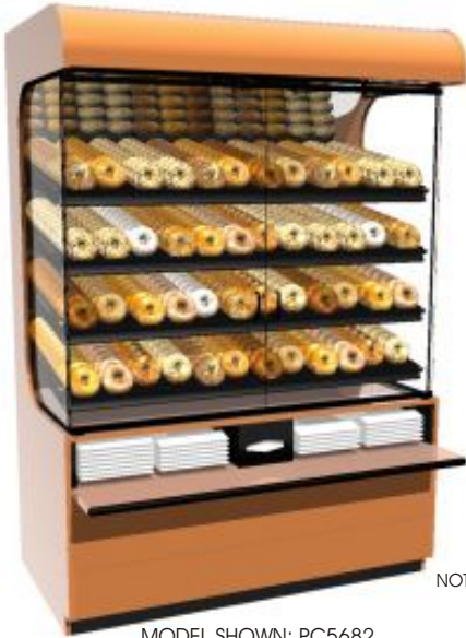
NOTE: SHOWN W/CUTAWAY END PANEL OPTION