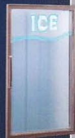
Optional LED Etched Glass Door

Material and product improvement is a constant commitment at Leer, Inc. These specifications are subject to change without notice and without incurring responsibility for previously sold merchandisers and components.