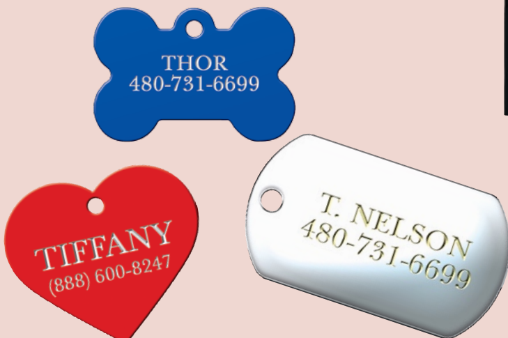
tags actual size